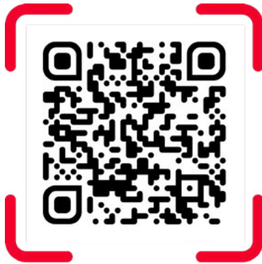
personal video message